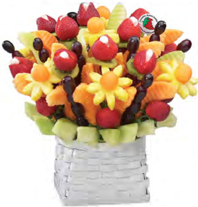
*baskets are pareve